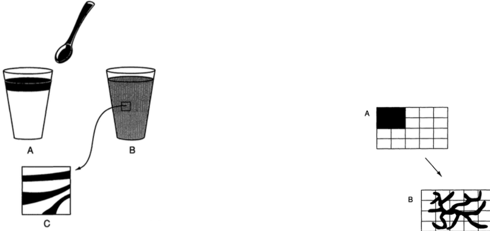
Figure 1: A drop of ink in a glass of water fibrillates throughout the whole volume, making the water look black on a coarse-grained level (pictured on the right hand side). Likewise, a probability density initially concentrated in one corner fibrillates across the available phase space (Sklar, 1993).

into the past) and so is “empirically disastrous”. The extent to which the success of the coarse-grained forwards, but not backwards, dynamics can be explained (in particular by appealing to cosmological considerations, such as postulating a ‘Past Hypothesis’) is controversial (see Earman (2006); Wallace (2011); Albert (2000, Ch. 4)). But in this paper, it will suffice to admit that the asymmetry has been added in here ‘by hand’ and thus that this project does not involve locating the ‘ultimate source’ of the time-asymmetry. For as announced in Section 1, I aim only to defend coarse-graining from various objections.