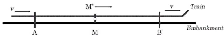
Figure 2: The relativity of simultaneity in Einstein's (2001: 27) example.

Imagine two inertial frames of reference. These are two rigid bodies, a train and a railway embankment.