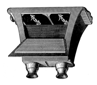
Figure 2. Wheatstone's stereoscope.