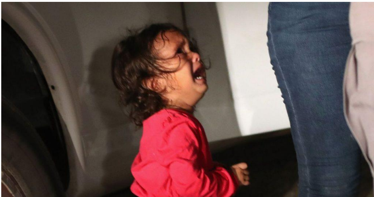
Figure 1. A photograph taken in June 2018 when, on the authority of President Donald Trump, United States immigration officials were separating children from their families at the Mexican border.

The second example of nativist bias relates to a phenomenon with yet broader implications for moral psychology – emotional contagion or affective empathy. Emotional contagion is what happens in the first few hundred milliseconds after one looks at Figure 1. Viewing this photograph, one feels the child’s distress immediately and viscerally - in the limbs, gut and respiratory system. Recent research in cognitive neuroscience suggests that emotional contagion – rapid, matching, visceral reactions to positive and negative emotions - plays a role in most, if not all, moral responses; in generating pro- and anti-social behaviour, and in formulating moral judgements. Brain imaging and electrophysiological measures indicate that emotional contagion is ubiquitous. It occurs whenever we see or are told about emotionally charged situations, even when we are actively encouraged to keep a cool head, or distracted by another task (e.g. Fan et al. 2011; Gonzalez-Lienres et al. 2013; Lamm et al. 2011).