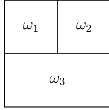
Figure 1: Indirect R-scalability

Now \Omega is maximal, and \{P_{\langle 12 \rangle}, P_{\langle 3 \rangle}\} is a 2-scale of \Omega , so Ramsey would say that