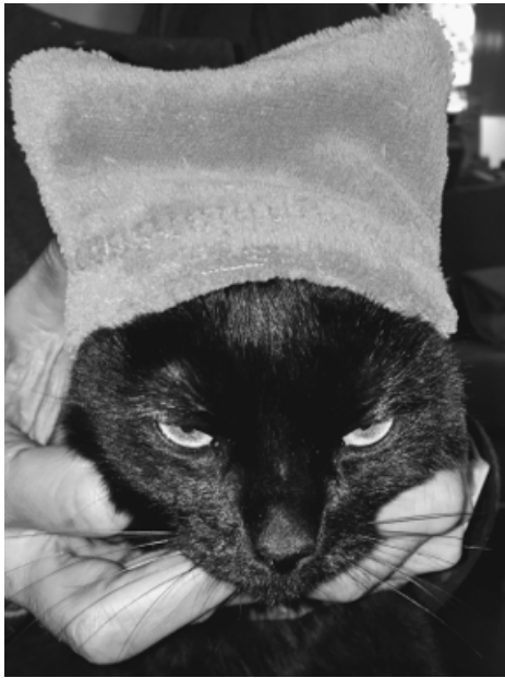
Fig. 1 A grayscale image of my cat Coco wearing a hat. This image contains 1434 \times 1076 \sim 1.5 million pixels. With 256 possible gray levels in each pixel, there are more than 256^{1542984} possible images of this size that could be generated — far more than the estimated number of atoms in the universe. Creating each of these images, one per nanosecond, would take many orders of magnitude longer than the time elapsed since the Big Bang.

result in optimal performance on a some particular task, such as classification or prediction.