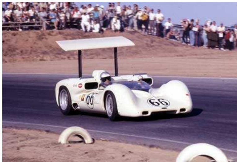
Figure 4: The high-winged Chaparral 2E of 1966.