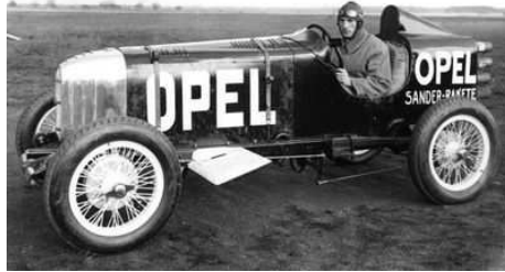
Figure 1: Opel's 1928 experimental rocket car, the RAK 1, with side-wings.