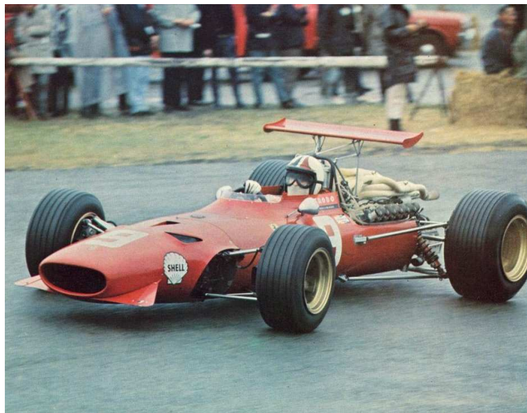
Figure 5: The winged Ferrari 312 of 1968.