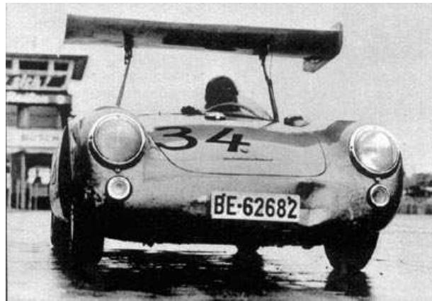
Figure 3: Michael May's 1956 Porsche 550 Spyder, with inverted wing.

on pivots, with a driver-adjustable angle of attack, and in 1966 the concept was extended to a dramatic high wing on the Chaparral 2E, (see Figure 4).