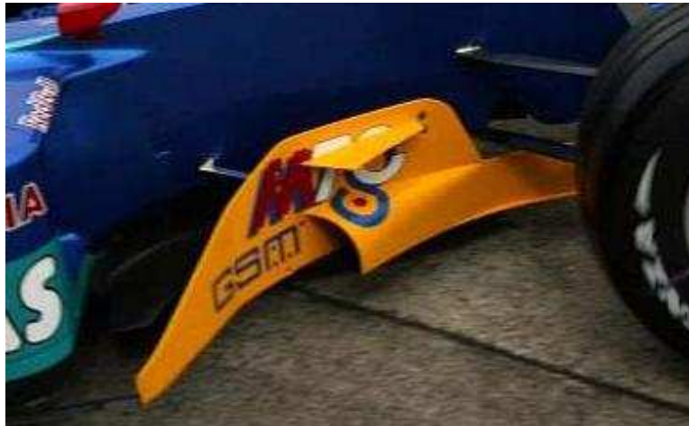
Figure 7: Modern Formula 1 bargeboard.