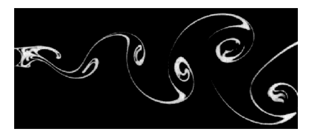
Figure 1: Wake behind a cylinder (on the left). The wake is formed by the vortices emitted on each side of the cylinder and carried away with the flow (from left to right)

The representational model that will be used to illustrate a case of generative constructive use of model is a model of the wake that develops behind a cylinder.