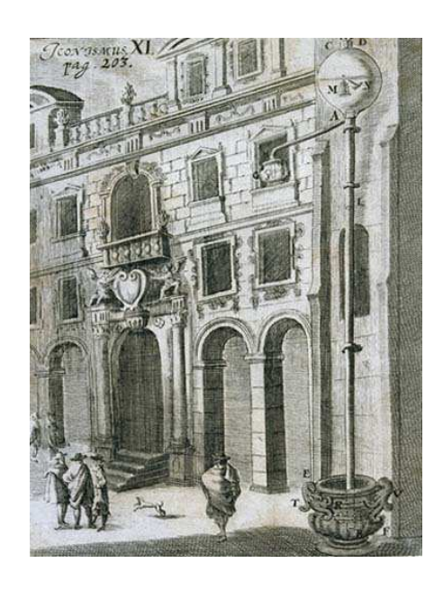
Figure 2: Engraving of a more complex version of Berti's experiment, reproduced in Schott (1664/1687, 203)

was to investigate the empty space itself: was it or was it not a vacuum? It is obvious from Magiotti's letter that this latter was a question of interest for him, and it was likely the most important question in the minds of the other participants as well; Zucchi and Kircher were both Jesuits who were convinced of the impossibility of the vacuum.