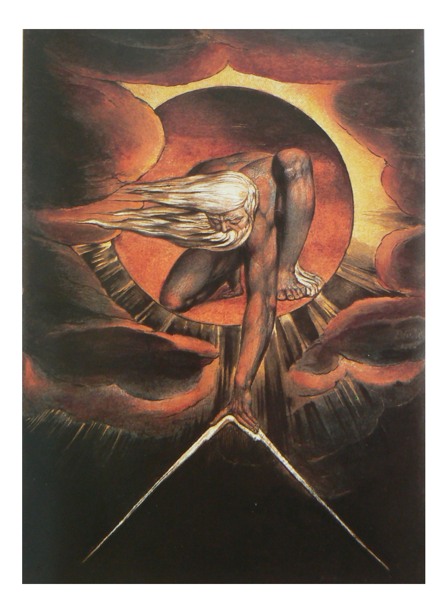
Figure 2: The Ancient of Days by William Blake. The creator is Urizen, representing law and reason; an entirely negative figure in Blake's mythology.