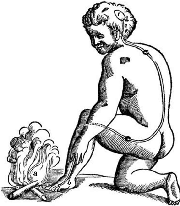
Fig. 1 The reflex arc of pain according to Descartes. The fire ( a ) is a stimulus afflicting the skin ( b ) and moving the fine thread ( c ), which goes to valves ( d , e ). The valves open the cavity ( f ), from which an animal spirit is released, which in turn makes the head turn and move the hand and the foot

nervous system: take in the incoming input, sensory information, and get the output, motor behavior. How could it be otherwise?