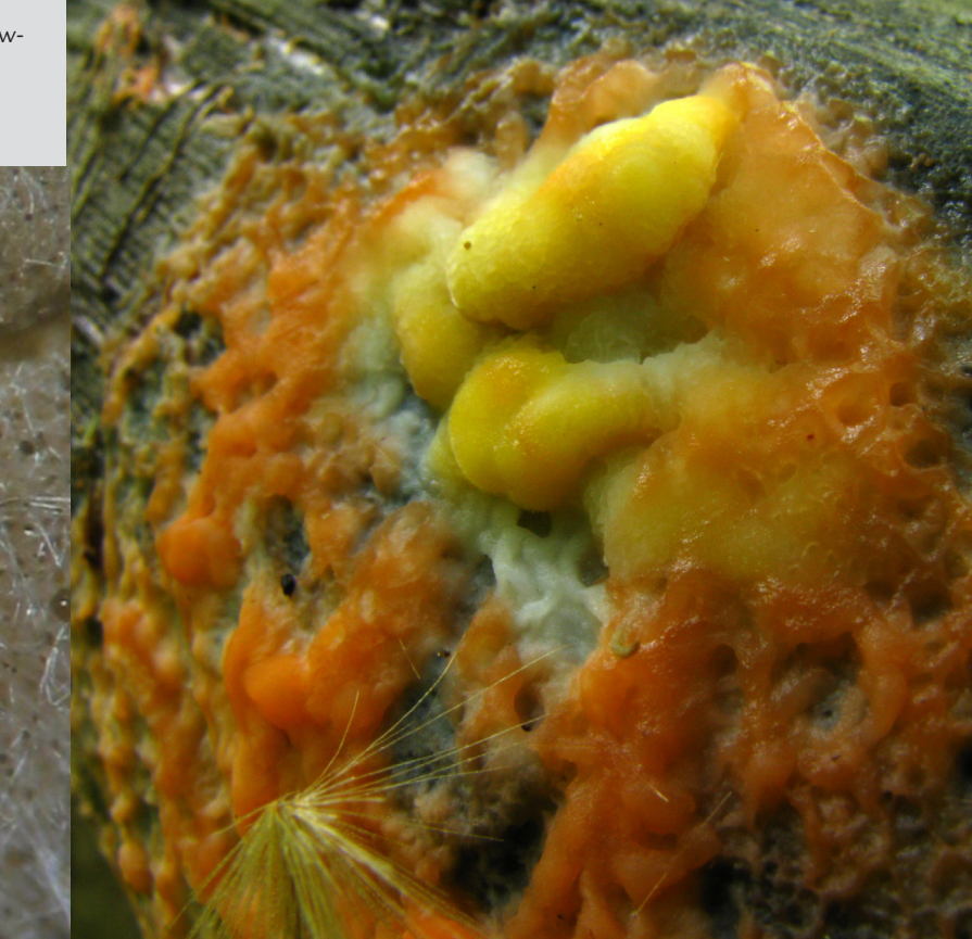
Image 3, below: In its later stages we find the fungi with the orange carotenoid pigments that give VOS its name.

Image 2, below: As filamentous fungi like this Mucor hiemalis start growing in the VOS, their hyphae add structure to it.